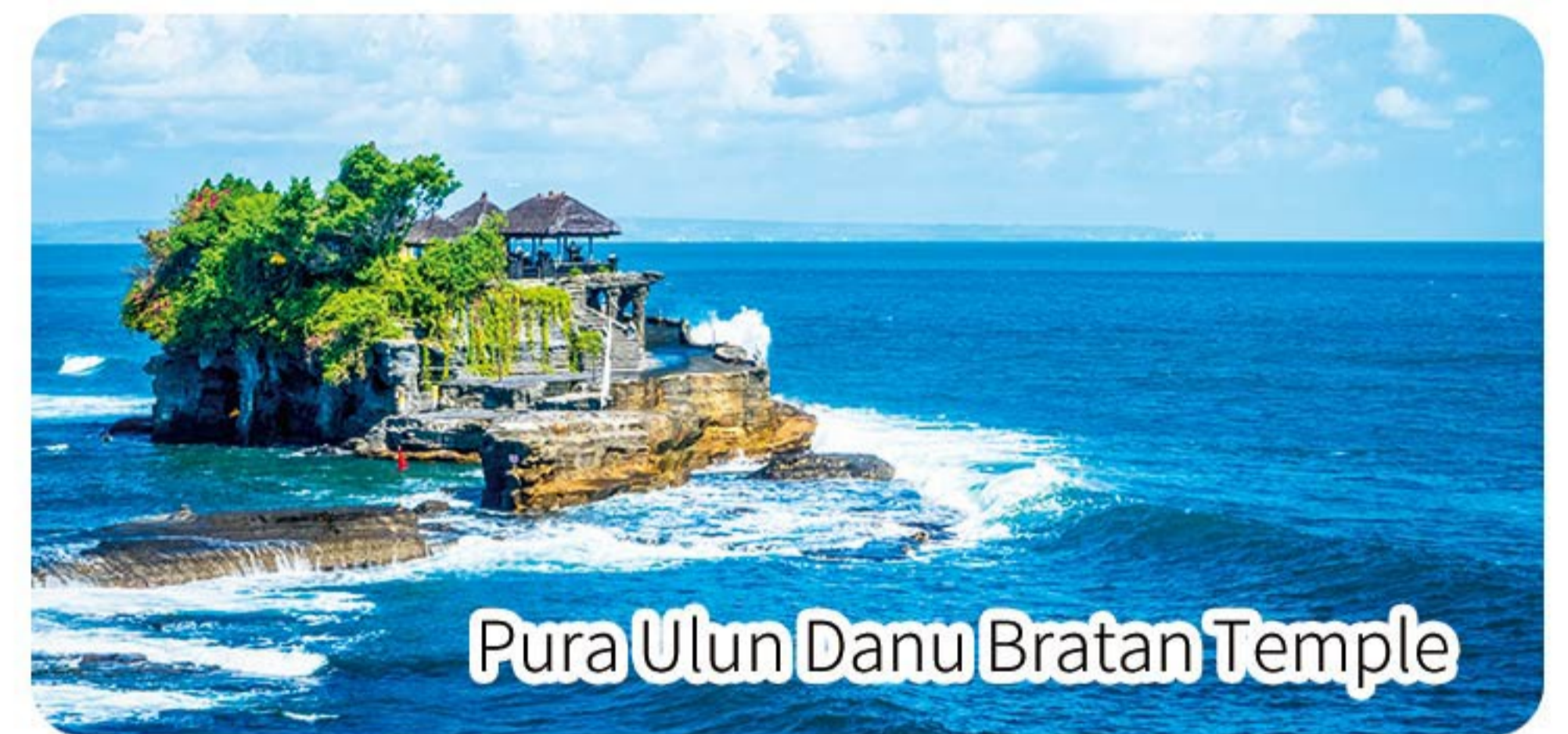
Pura Ulun Danu Bratan Temple