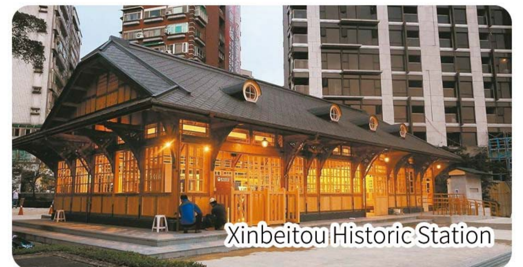
Xinbeitou Historic Station