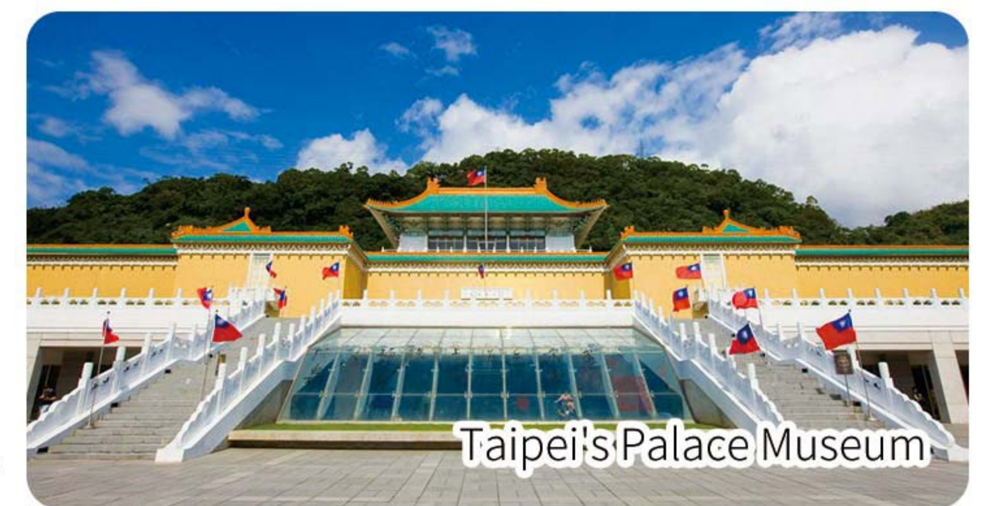
Taipei's Palace Museum

Hotel: Hamp Court Palace Taipei or Fullon Hotel Taipei Central or similar